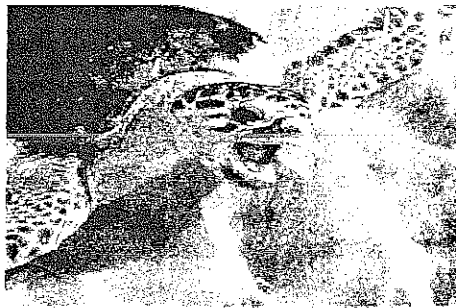
A sea turtle is fed at the Marine Turtle Rescue Center on Linosa, a small volcanic island south of Sicily August 8, 2008.

The baby turtles — which ended up under the tables of startled diners at the beachside restaurant — were probably thrown off track and lured by the eatery's bright lights, said Antonio Colucci, who was called to help rescue the group.